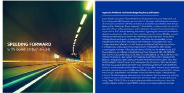
ART CARD SUPERS: SPEEDING FORWARD with lower-carbon eFuels Proxy legalese