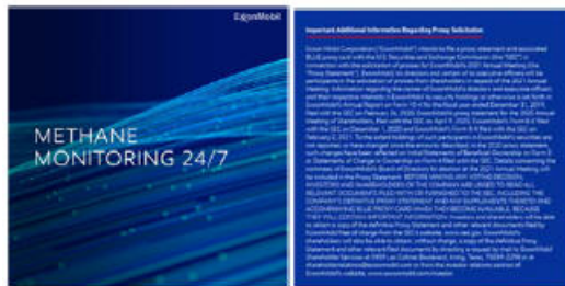
Methane Monitoring 24/7