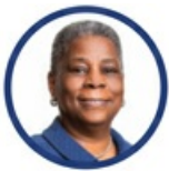
Ursula M. Burns Former Chairman of the Board & CEO, VEON, Ltd.