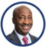
Kenneth C. Frazier Chairman of the Board & CEO, Merck & Co.