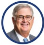
Samuel J. Palmisano Former Chairman of the Board, President & CEO, IBM