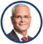
Darren W. Woods Chairman of the Board & CEO, Exxon Mobil Corporation