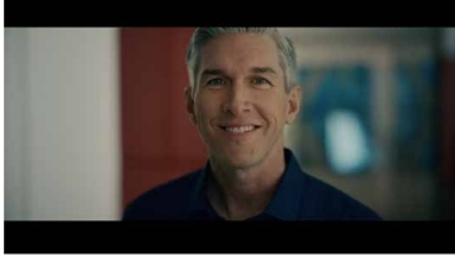
FLASHING THROUGH VARIOUS EXXONMOBIL EMPLOYEES