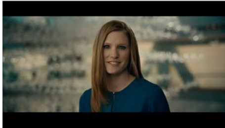
FLASHING THROUGH VARIOUS EXXONMOBIL EMPLOYEES