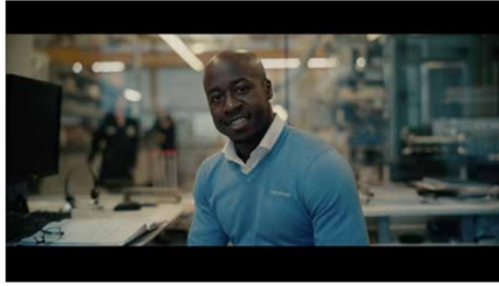
FLASHING THROUGH VARIOUS EXXONMOBIL EMPLOYEES