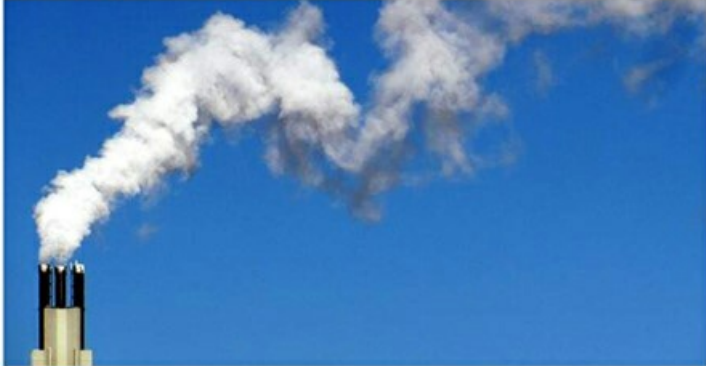
Exxon Pushed for Net-Zero Goal by Activist Shareholder