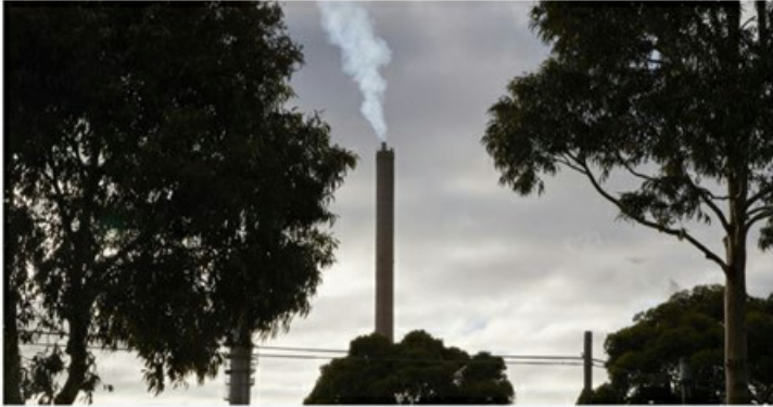
Exxon Pushed for Net-Zero Goal by Activist Shareholder