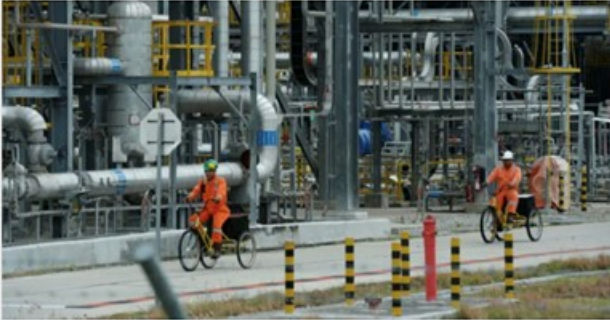
ExxonMobil reports $22bn annual loss | Financial Times ft.com