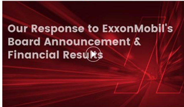
Our Response to ExxonMobil's Board Announcement & Financial Results

Engine No. 1 believes #ExxonMobil's (NYSE: XOM) actions further confirm the need for meaningful Board change; objects to underperforming Board's plan to pick Its own new members 🙅 https://bit.ly/2YE0kcs #ReenergizeExxon