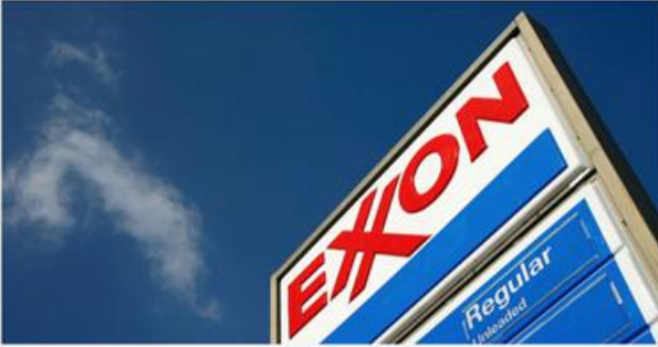
Bloomberg - Exxon's Suddenly Trouncing Chevron. Coincidence? bloomberg.com